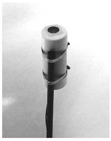
Illustration 1: Installed outdoors