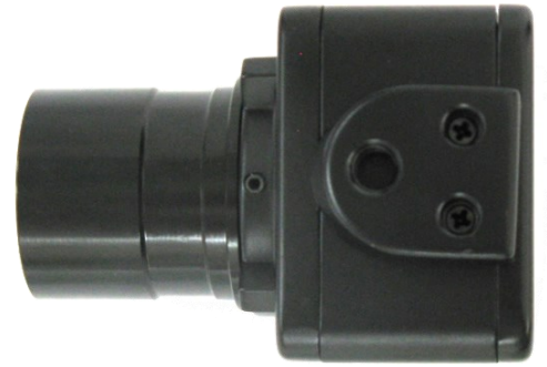
Camera has a female Kodak thread socket