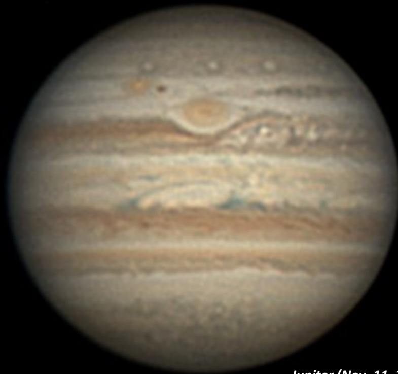
Jupiter (Nov. 11, 2012)