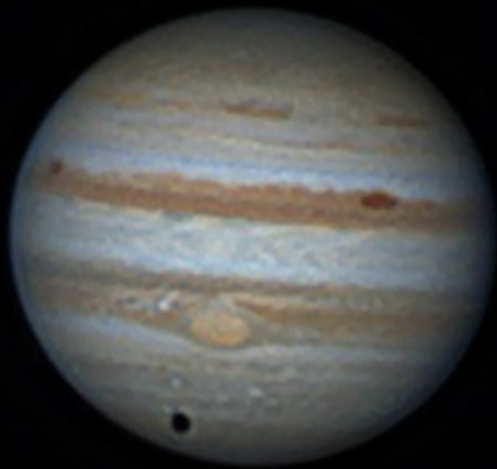
Jupiter (Oct. 3, 2011)