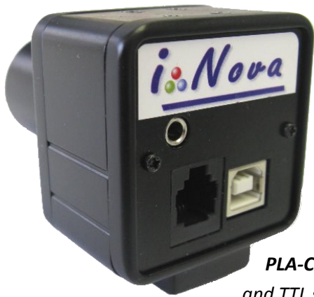
PLA-C2 Camera - USB2.0 , ST4 and TTL serial communication ports