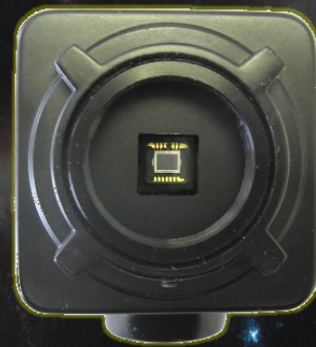
PLA-C2 Camera - Front side