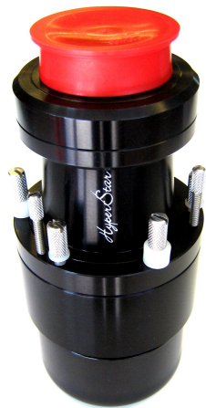
Holder capping the HyperStar