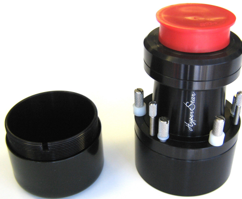
Holder removed to accept secondary mirror