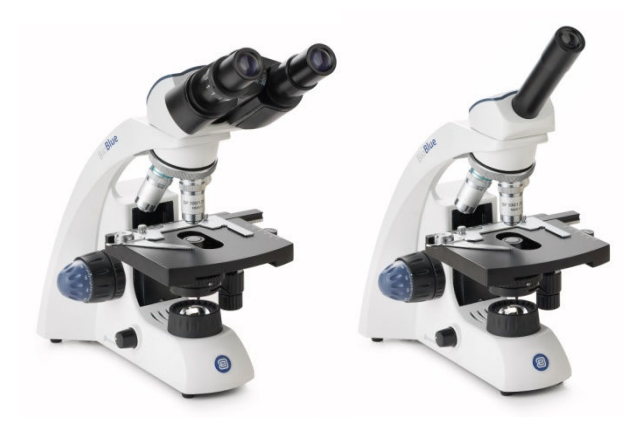
Binocular model BB.4260