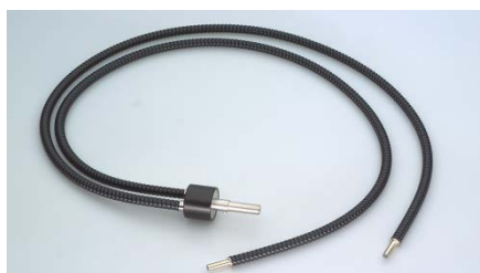
Flexible light guide 2 branch