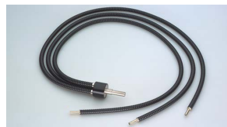
Flexible light guide 3 branch