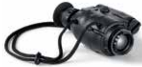
RECON M18 (640)