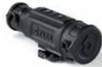
RS24 | 1X