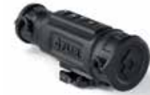
RS32 | 4-16X