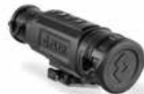
RS64 | 1.1-9X