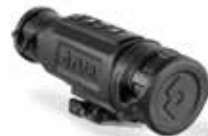
RS64 | 2-16X