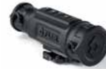
RS32 | 2.25-9X