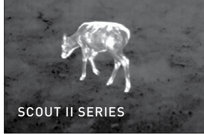
SCOUT II SERIES