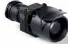
MILSIGHT T105 UNS