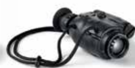
RECON M18 (320)