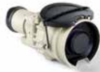
MILSIGHT S135 (MUNS)