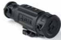
RS32 | 1.25-5X