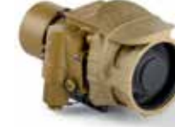
MILSIGHT T90 (TaNS)