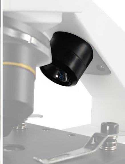
Fig. Knob Fig. Transmitted light Fig. Incident light

The knob (13) on the left-hand side can dim the entire lighting steplessly. To gauge the dimming level, there is a scale of 1-8 for the steplessly set position.