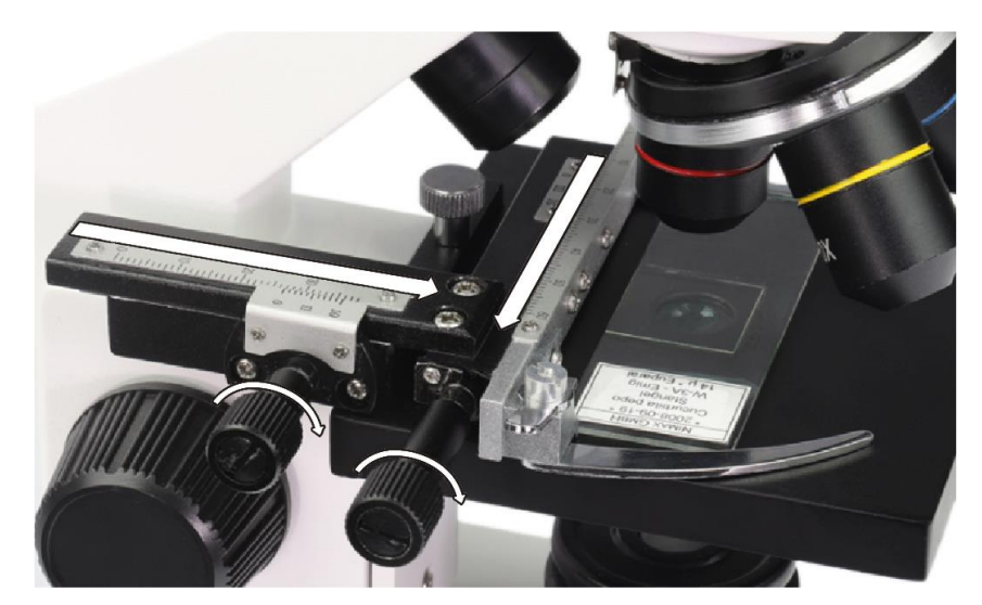
Fig. Use of the optional mechanical stage adapter (Art.No.62506)

Now you can increase the magnification: Simply turn the 10x eyepiece into position. The specimen will appear blurred again; but by turning the focus wheel (10) you can bring it into focus again. You will be amazed how many details you can see with a 100x lens.