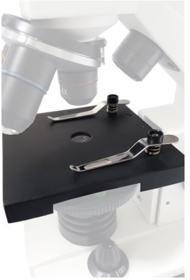
Fig. 6. The specimen stage.

1.2.4 The specimen stage. Place the specimens that you want to examine later on the specimen stage (7). This has two specimen spring clamps (8) that hold the respective specimen in place on the specimen stage. When you clamp the slides (8), they are held in position so that you can examine them manually under the lens. The specimen stage (7) itself is always in a specific position that can be adjusted using the two large black focus wheels (10) on the right and left of the Omegon VisioStar. You will see how the table rises and lowers when the wheels are turned.