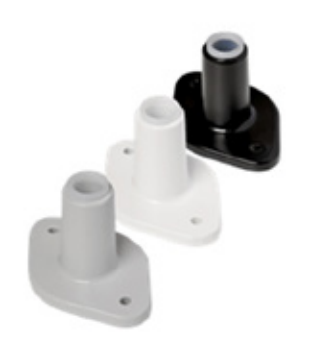
Surface Mounted Bracket