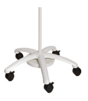
Floor Stand (Trolley) With Extra Weight