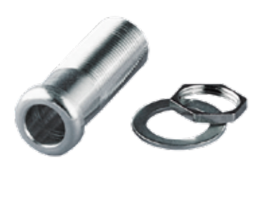
TE Table Bushing