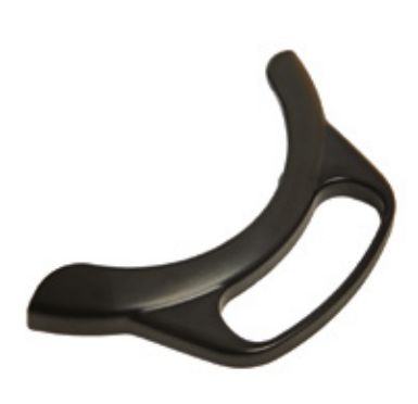
KFM LED Handles