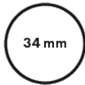
Main tube 34 mm